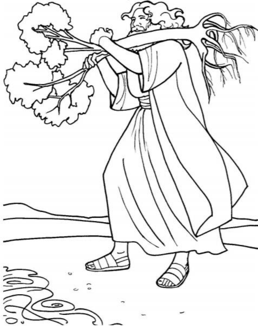
Moses throws a piece of wood into the water and it becomes sweet

Exodus 15: 26 “If you will diligently listen to the voice of the LORD your God, and do that which is right in his eyes, and give ear to his commandments and keep all his statutes, I will put none of the diseases on you that I put on the Egyptians, for I am the LORD, your healer.”